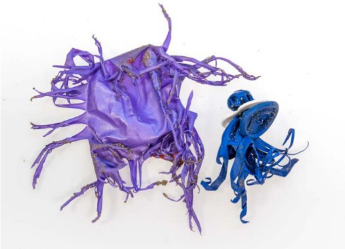
Remains of balloons that have likely exploded high in the atmosphere, with missing parts probably falling down as smaller pieces of latex.

This is a study by the balloon industry. It is argued that latex balloons almost all explode into small fragment in the freezing low pressure conditions of the high atmosphere. It also states that the degradation of the small rubber bits, once back on earth, would be as fast as that of oak leaves, suggesting that this can present no danger. The oak leaf comparison is taken on board because experiments showed that balloon rubber had only lost a few percent of its original mass after 6 weeks. Oak leaves take a long time to decompose!