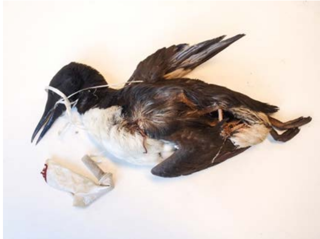
This Guillemot ( Uria aalge ) became entangled in a ribbon with remains of the latex balloon and plastic valve

Debris from balloons represents a danger, because animals may become entangled in ribbons preventing normal foraging activity. Animals also mistake balloon debris for food and ingest the material, which may block the stomach or intestines and lead to starvation.