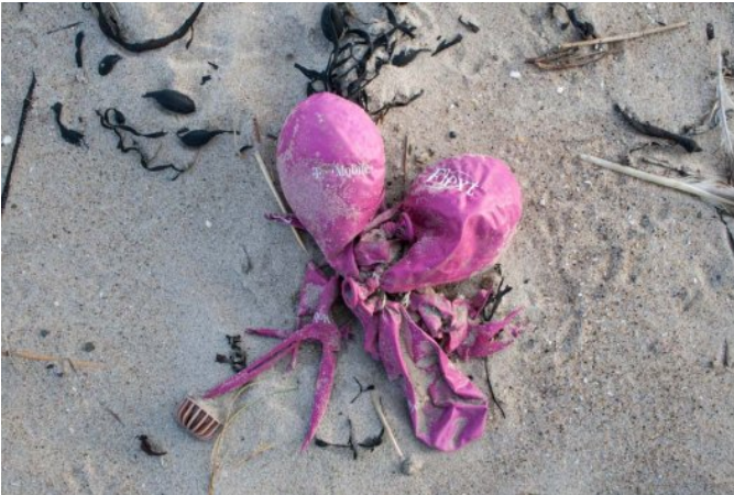
A bundle of advertising balloons, of which some seem to have exploded high in the atmosphere, while others have descended almost unchanged.

Surprisingly little scientific research has been done to investigate the degradability and potential harm from latex balloons in natural environments.