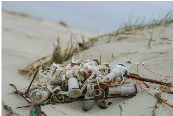
Plastic ribbons, balloon valves and washers end up as debris in nature.