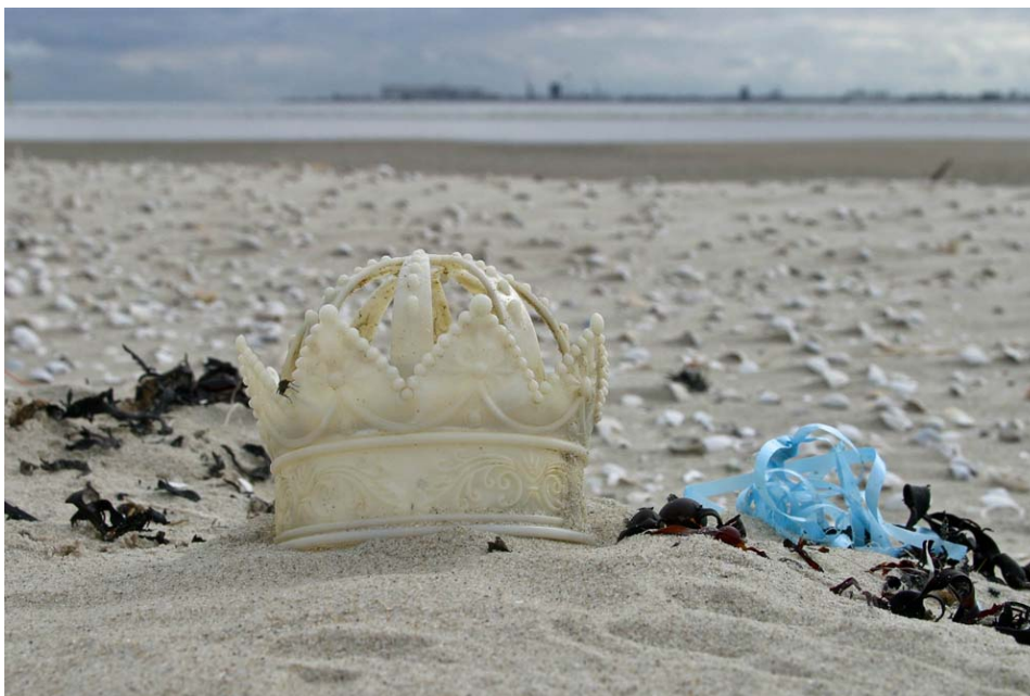
King's Day on the beach: a beached plastic toy crown and balloon ribbon found side by side on the beach of Texel

Jan van Franeker IMARES P.O.Box 167 1790 AD Den Burg (Texel) The Netherlands E: jan.vanfraneker@wur.nl