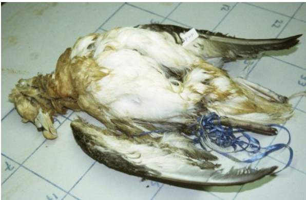
Northern Fulmar ( Fulmarus glacialis ), entangled in balloon ribbon.