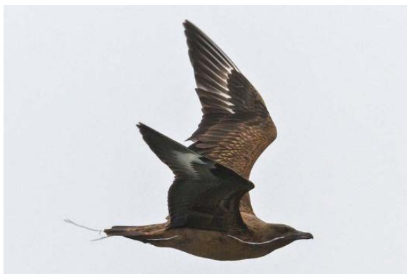
Great Skua ( Catharacta skua ) with apparently ingested balloon and the ribbon hanging from the mouth. Photographed central North Sea by Hans Verdaat.